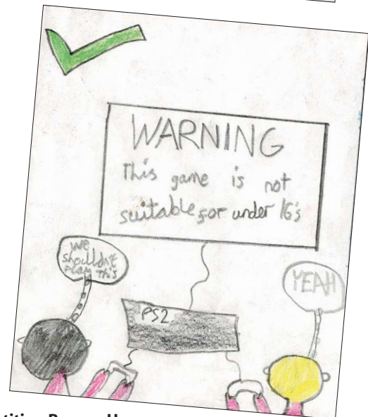
Competition Runner Up